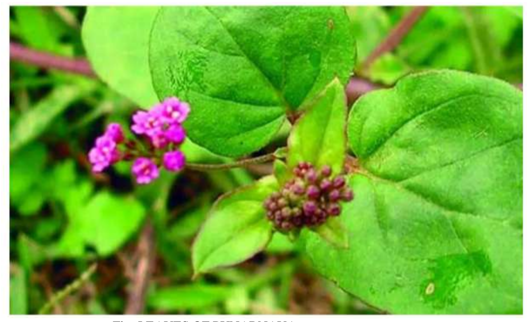
Fig -LEAVES OF PUNARNAVA

Seeds: Seeds are tonic expectorant, carminative, useful in lumbago, scabies. The seeds are considered as promising blood purifier. Seeds are used as energizer and for help in digestion.