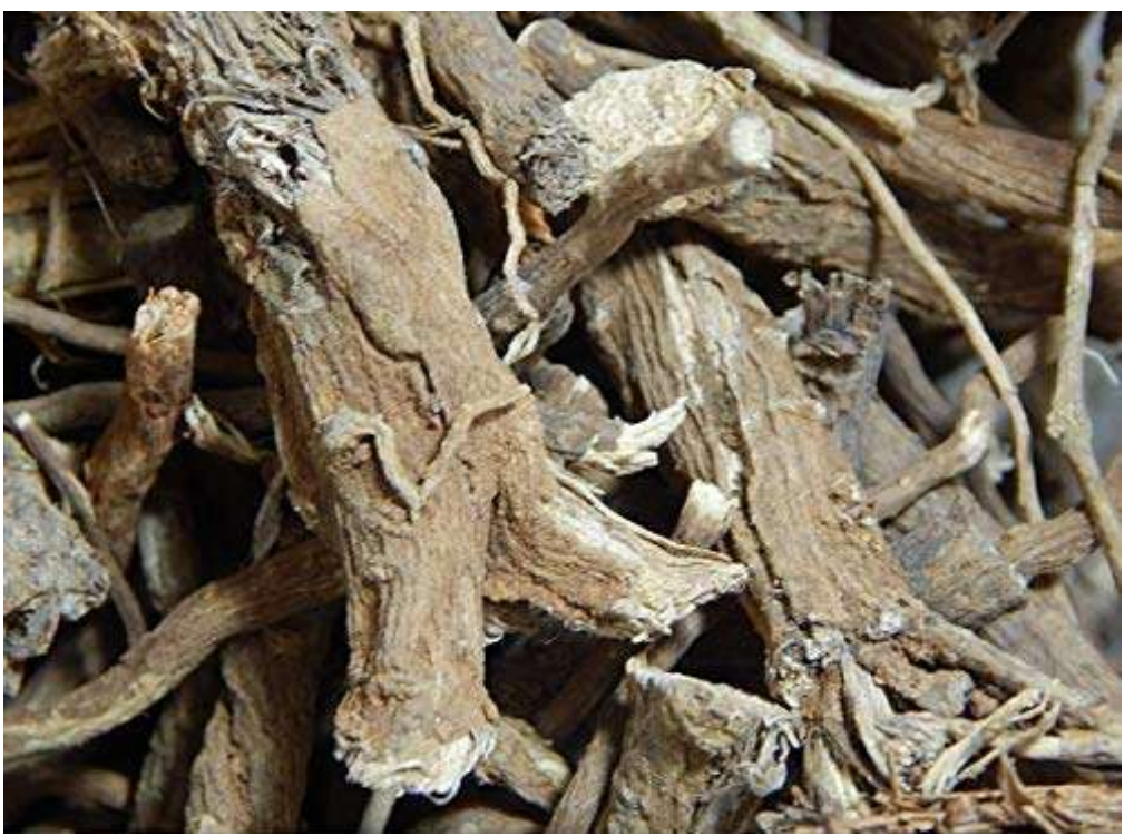
Fig - ROOT OF PUNARNAVA

Volume 8, Issue 1 Jan-Feb 2023, pp: 933-944 www.ijprajournal.com ISSN: 2249-7781